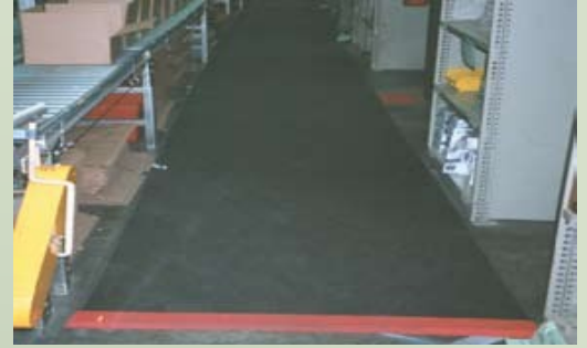
Ortho 1 Molded Material with Antimicrobial