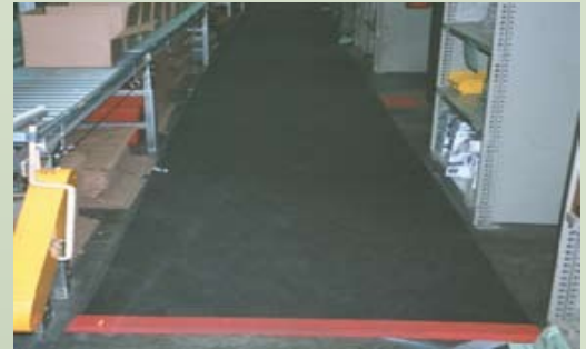
Ortho 1 Molded Material with Antimicrobial